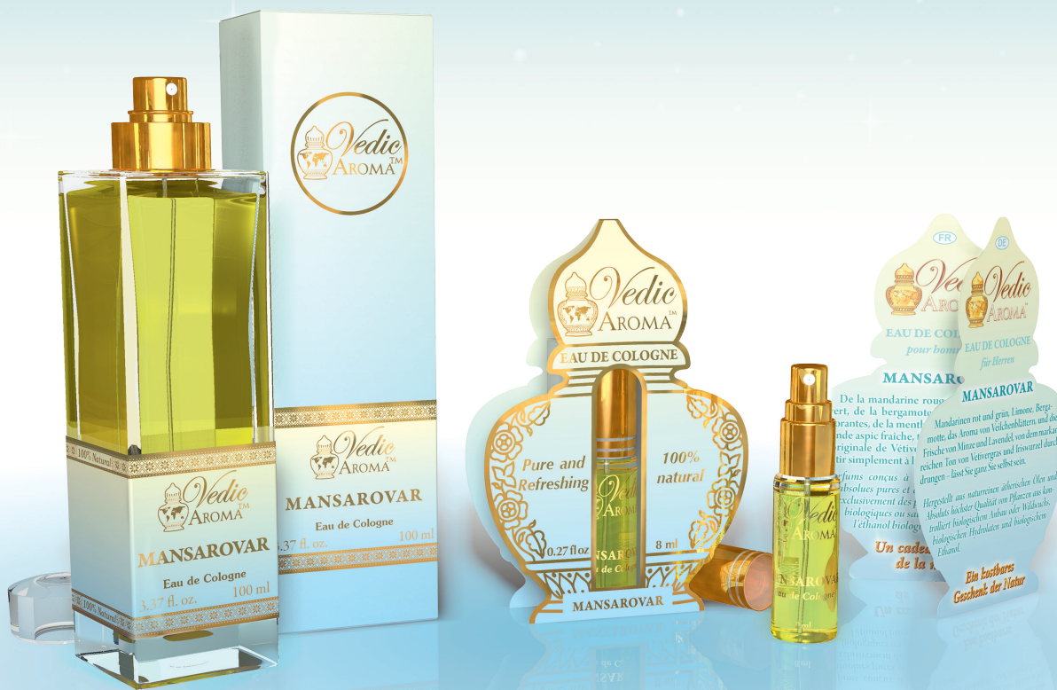
100 ml spray bottle