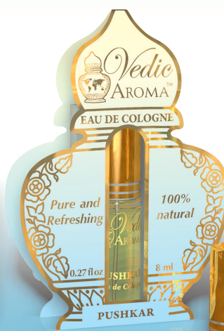
8 ml spray bottle boxed with Kalash card in four languages