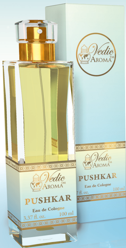
100 ml spray bottle