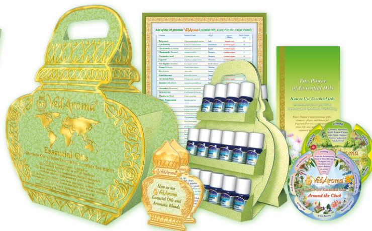
Luxury Kalash Bag and Stand containing 30 VedAroma essential oils