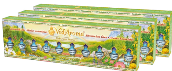
Luxury Boxed Sets containing 10 VedAroma essential oils