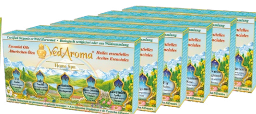
Luxury Boxed Sets containing 5 VedAroma essential oils