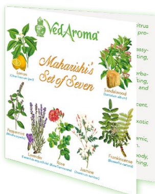
Maharishi's Set of Seven essential oils