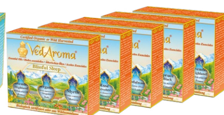
Luxury Boxed Sets containing 3 VedAroma essential oils