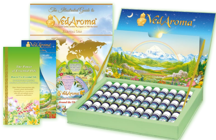
Luxury Boxed Sets containing 33 VedAroma essential oils